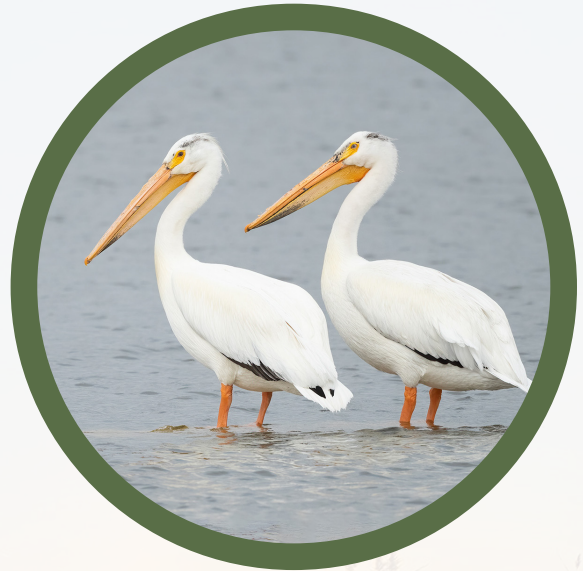
American White Pelicans

This van trip covers up to six locations, time and birding permitting. Willow Point Wildlife Area consists of a flat gravel road that the group will walk up and down, which has potholes and other damage due to erosion. Pit/vault, accessible restrooms are available at Castalia Quarry Park, roughly 10 minutes down the road. There is a 0.15-mile walk on an uphill trail with loose gravel to reach the restrooms. The birding at Resthaven Wildlife Area takes place along paved parking lots, mowed grassy trails, or packed gravel roads. All of these options are flat but may show some wear and unevenness. Pickerel Creek is all grassy paths running between wetland cells with some short but steep inclines to get to them. They are flat once on top. Tall grass may make holes and uneven areas hard to see. Boggy Bottoms involves birding along a flat gravel road. Blue Heron Reserve has a somewhat warped, uneven boardwalk with no railing or lip.