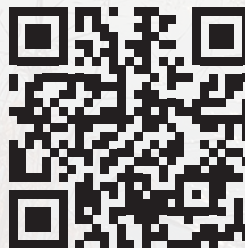
Pipe Creek eBird Page

Your field trip leaders are responsible for eBirding all of The Biggest Week In American Birding field trips. They will be keeping lists during the day for all sites visited. These will become available for participants to add to their eBird accounts. Please be patient as our dedicated festival volunteers sort the checklists that are being submitted and upload them to The Biggest Week In American Birding website. Please allow a few days for this process to take place. You can check the status of your eBird lists by visiting biggestweekinamericanbirding.com and clicking "Area Info" in the top menu and selecting "Field Trips" and then "eBird Checklists" from the dropdown menu. Select the day of your field trip from our menu and look for the trip you attended. There you will find all of the links to the different eBird lists submitted by your field trip leader.