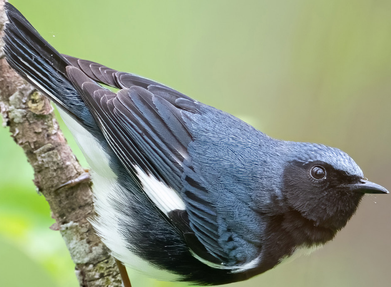
Black-throated Blue Warbler