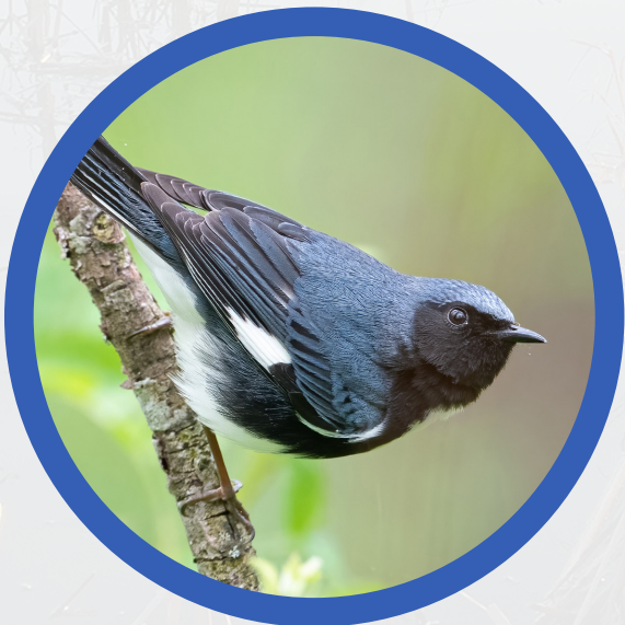
Black-throated Blue Warbler