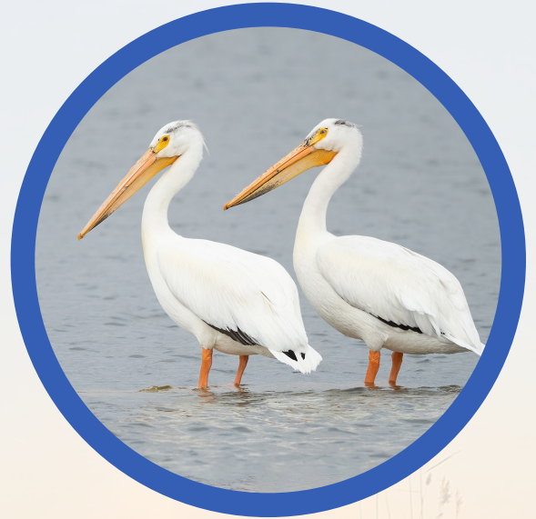
American White Pelicans

This van trip covers up to six locations, time and birding permitting. Willow Point Wildlife Area consists of a flat gravel road that the group will walk up and down, which has potholes and other damage due to erosion. Pit/vault, accessible restrooms are available at Castalia Quarry Park, roughly 10 minutes down the road. There is a 0.15-mile walk on an uphill trail with loose gravel to reach the restrooms. The birding at Resthaven Wildlife Area takes place along paved parking lots, mowed grassy trails, or packed gravel roads. All of these options are flat but may show some wear and unevenness. Pickerel Creek is all grassy paths running between wetland cells with some short but steep inclines to get to them. They are flat once on top. Tall grass may make holes and uneven areas hard to see. Boggy Bottoms involves birding along a flat gravel road. Blue Heron Reserve has a somewhat warped, uneven boardwalk with no railing or lip.