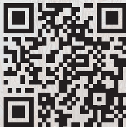
Resthaven WA eBird Page