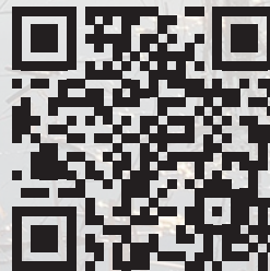
Pickerel Creek WA eBird Page